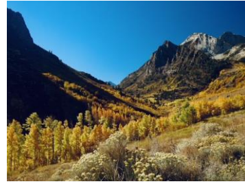
Joel Kuechle has been hiking in the Eastern Sierras (again!)